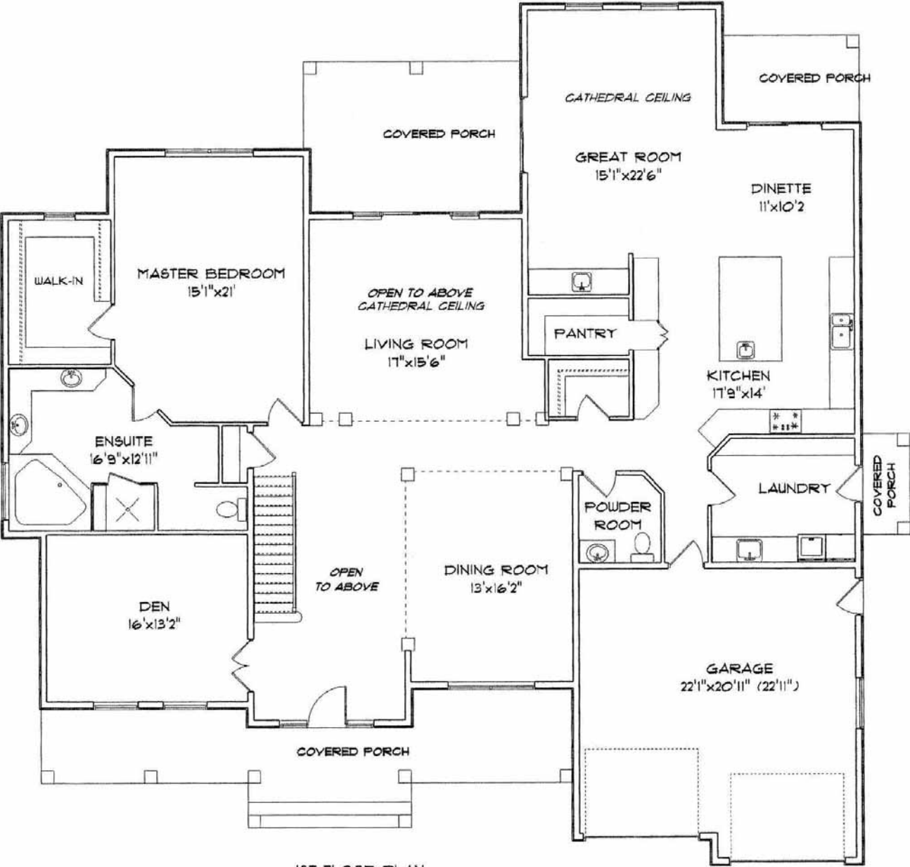
1ST FLOOR PLAN 2801 sq/ft (260.22 sq/m)

SHARON HOMES CONSTRUCTION 1280 FORESTHILL OAKVILLE, ON OFFICE: 905 338-6525 FAX: 905 338-6795