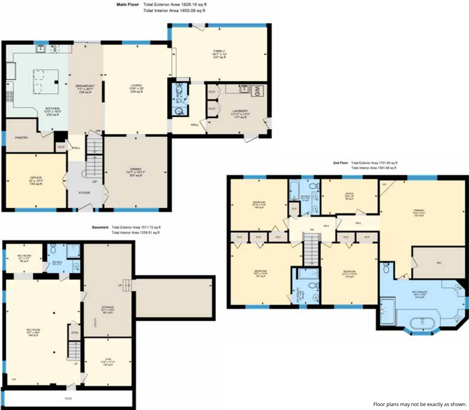
Floor plans may not be exactly as shown.