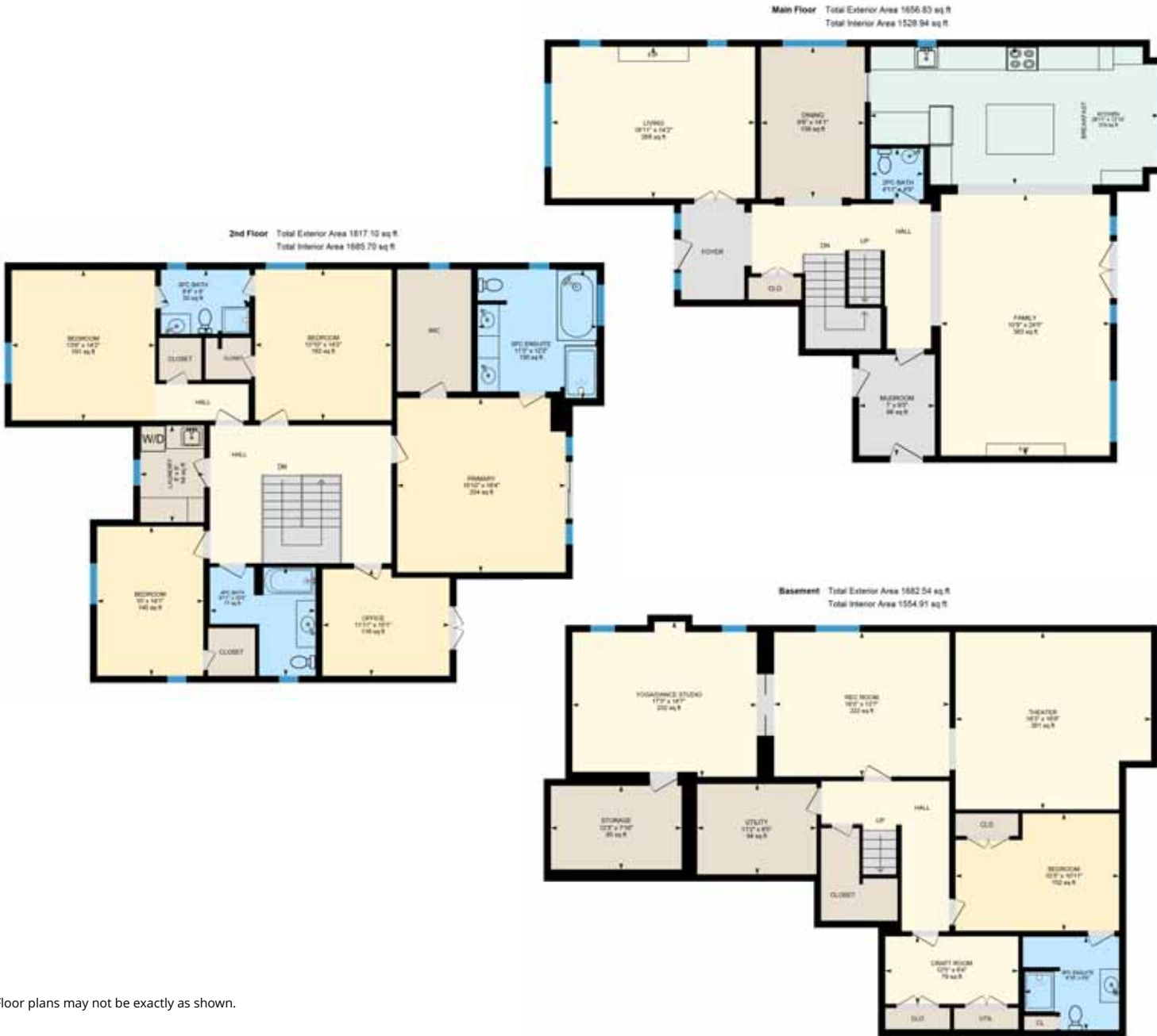
Floor plans may not be exactly as shown.