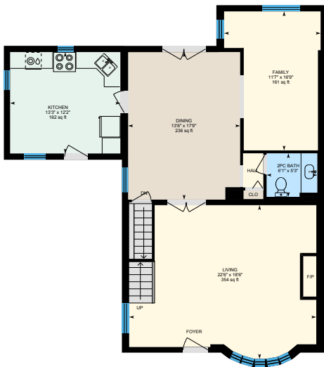
Main Floor Exterior Area 1159.95 sq ft

Main Building: Total Exterior Area Above Grade 1915.06 sq ft