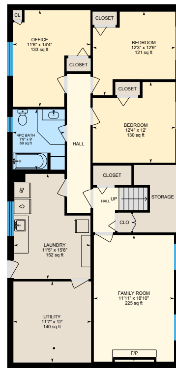
Basement (Below Grade) Exterior Area 1403.05 sq ft