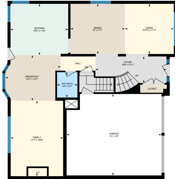
Main Floor Exterior Area 1016.50 sq ft

Main Building: Total Exterior Area Above Grade 2226.59 sq ft