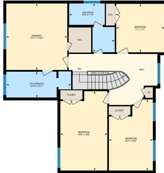
2nd Floor Exterior Area 1210.09 sq ft