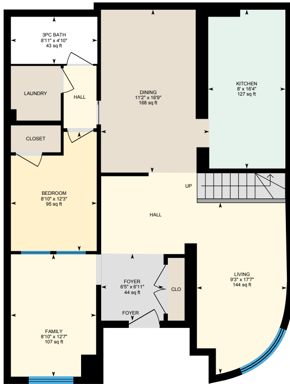
Main Floor Exterior Area 1047.96 sq ft

Main Building: Total Exterior Area Above Grade 1647.08 sq ft