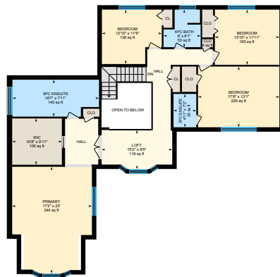
2nd Floor Exterior Area 1924.51 sq ft