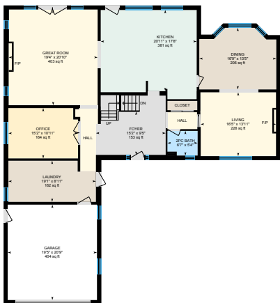
Main Floor Exterior Area 2142.22 sq ft

Main Building: Total Exterior Area Above Grade 4066.73 sq ft